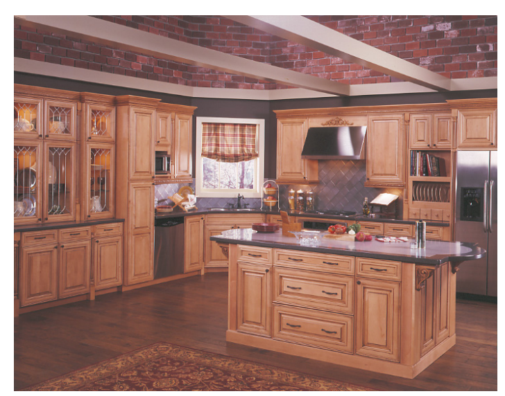
McKinley Maple Coffee Kitchen Cabinetry